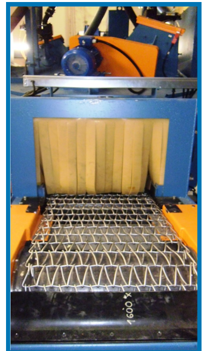
RB-850 AH 8

Dust emission after the filter is not more than 3\text{mg}/\text{m}^3 .