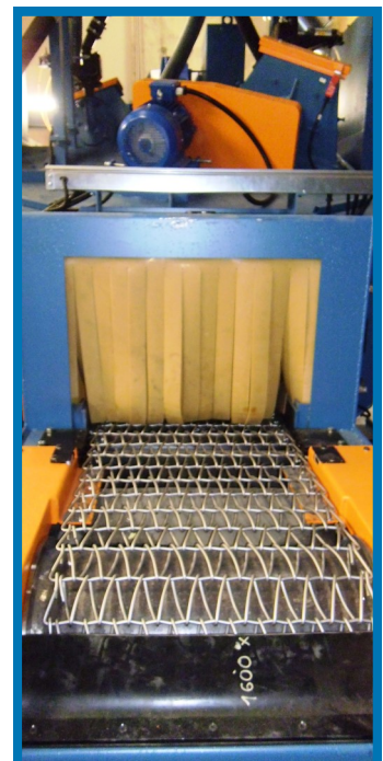
RB-600 AH 4

Dust emission after the filter is not more than 3\text{mg}/\text{m}^3 .